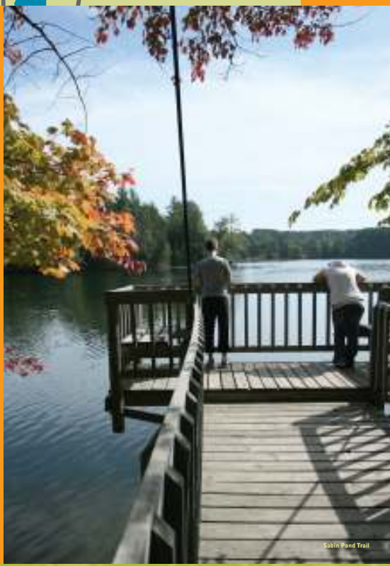
Sabin Pond Trail